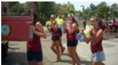
Cheerleaders performing a car wash cheer

JV and Varsity cheer held a car wash Aug. 29th at Sweetwater Springs off the 94 Freeway from 8-3:00 p.m.